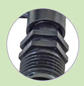
Neck Spring Protection Cover

Specially designed color coded nozzle for different flow rates