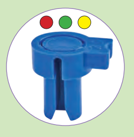
Different Flow Rates Available

Unique turbo hammer for uniform rotation