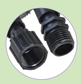
Threaded Inlet Connection

Available in \frac{1}{2} " male or \frac{1}{2} " female BSP threaded connections