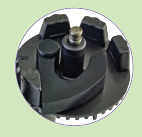
Special Hammer for Rotation

Integrated corrugated jet spreader for uniform distribution