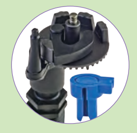
Easy to Assemble & Disassemble

Additional cover provided for neck spring protection