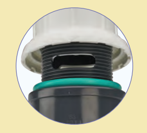
Easy to ON / OFF Threaded facility to open to easiness for flushing dirt from sub main