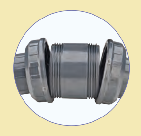
Easy to Install and Dismantle

Float is provided with special guides to seal properly