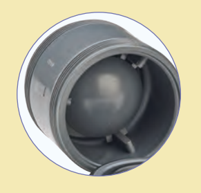
Guided Float Slides Smoothly

manufactured from high performance rigid PVC compound