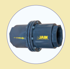
Non Return Valve with Low Friction Option

Two union nuts provided for both ends provides easiness to install and dismantle valve