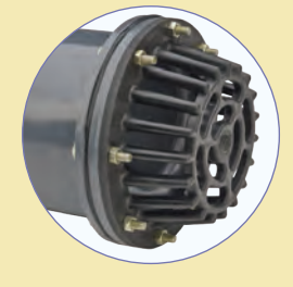
Unique Design of Strainer

Innovative design manufactured from high performance rigid PVC compound