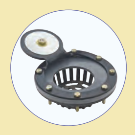
Excellent and Long Life Seal

Unique design of strainer effectively screens trash and ensures minimum obstruction to flow.