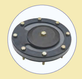
Precise Weight for Rubber Cap

Positive shut off prevents leakage & avoids repeated priming of the pump.