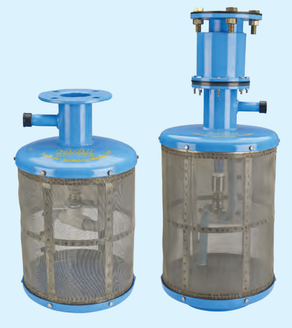
Features & Benefits