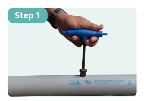
Use drill size of 17.5 mm to make the drill hole on the pipe.