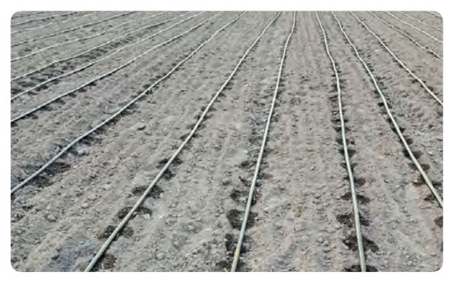
Uniform Distribution of water even at1 m pressure head.