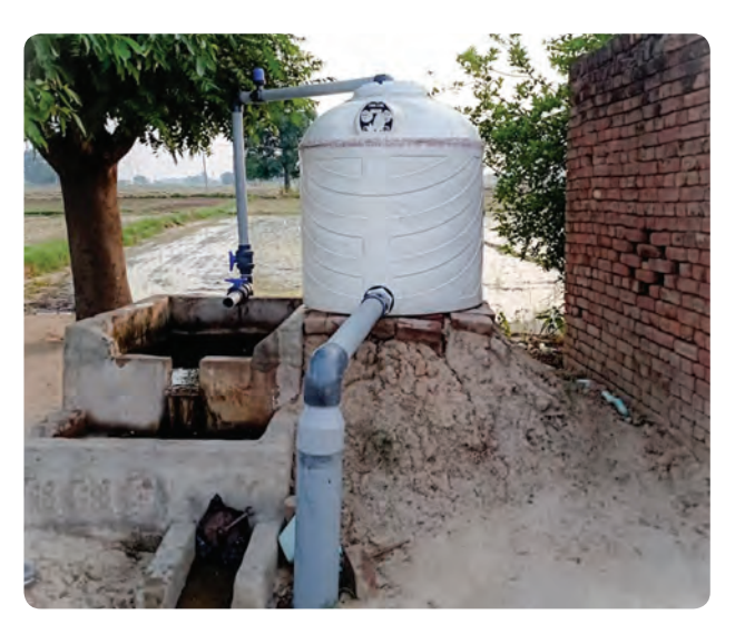
Water Holding Tank at an Average Height of 1m