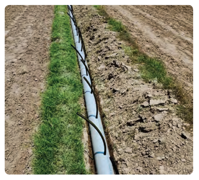
Laying of Submain. L/L spacing 0.6m